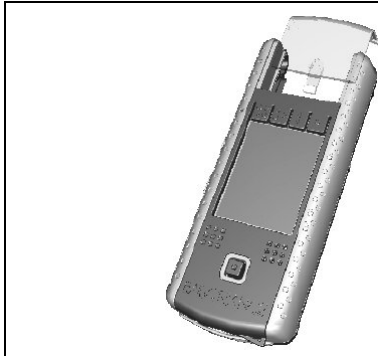
Figure 2. EvoPrimer target boards