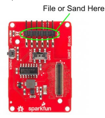
File or Sand the Connector Here

If you need to use the UART block in the middle of a stack, it may be necessary to file or sand the FTDI connector. The connector is slightly larger than the 3mm clearance allowed by the expansion connectors. It is preferred that the user place this Block a the bottom of a stack.