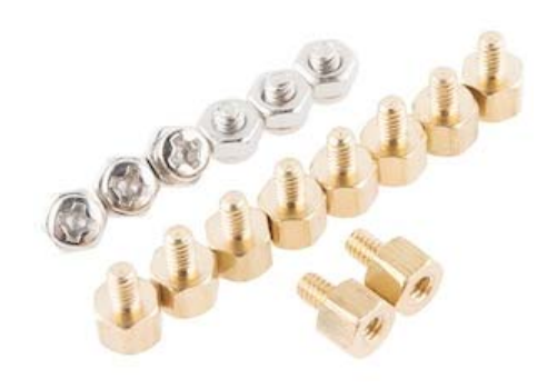
Intel Edison Hardware Pack