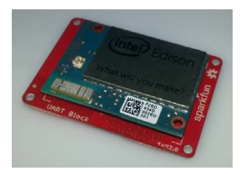
UART Block Installed

To use the UART Block, attach an Intel Edison to the back of the board or add it to your current stack. Blocks can be stacked without hardware, but it leaves the expansion connectors unprotected from mechanical stress.