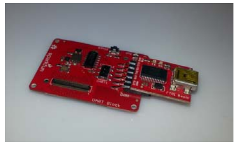
FTDI 5V Basic Installed

The UART Block can be used with our 5V FTDI Basic.