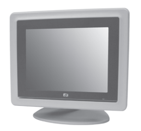
▲ Deskton stand