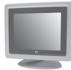
▲ Desktop stand