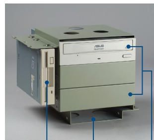
One 3.5" drive bay Three 5.25" drive bays One internal 3.5" drive bay space