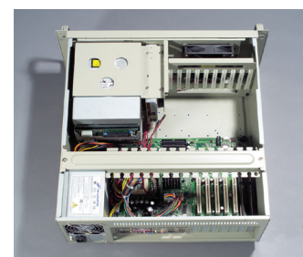
Motherboard can fit in 450 mm (17.7") depth