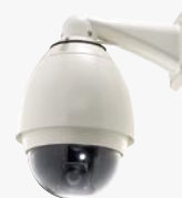
FCS-4020 Day/Night Speed Dome Pro Network Camera (35x Optical 200m)