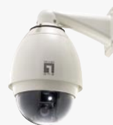
FCS-4010 Day/Night Speed Dome Pro Network Camera