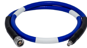
CASE STYLE: HW1223-4