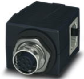
Control cabinet feed-through, M12, 8-pos., A-coded on RJ45 socket, socket input 90°, IP65/67

Please be informed that the data shown in this PDF Document is generated from our Online Catalog. Please find the complete data in the user's documentation. Our General Terms of Use for Downloads are valid ( http://phoenixcontact.com/download )