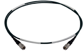
CASE STYLE: RF2512-6