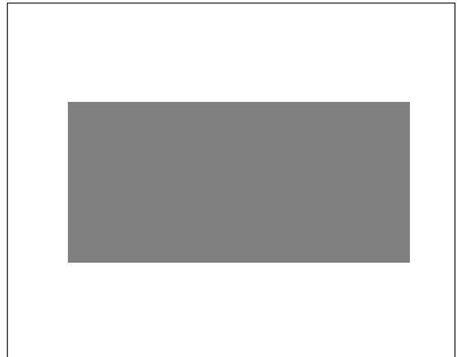
Fig.5 The SP1648 operating in the voltage-controlled mode

C_S = shunt capacitance (input plus external capacitance).