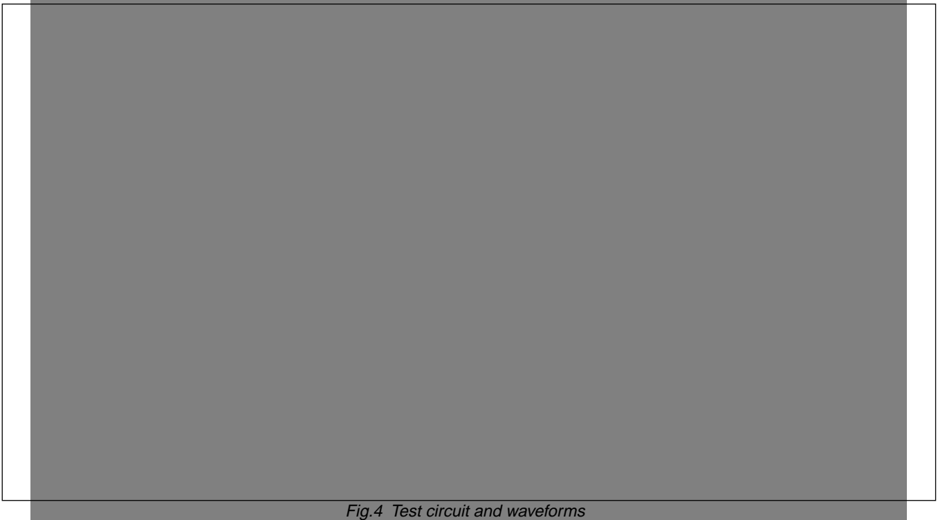
Fig.4 Test circuit and waveforms

In order to maintain the high Q of the oscillator, and provide high spectral purity at the output, a cascode transistor (TR4) is used to translate from the emitter follower (TR5) to the output differential pair TR2 and TR3. TR2 and TR3, in conjunction with output transistor TR1, provide a highly buffered output which produces a square wave. Transistors TR10 through TR14 provide this bias drive for the oscillator and output buffer. Fig.3 indicates the high spectral purity of the oscillator output.