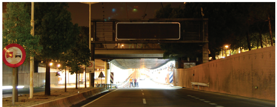
T-Max fixtures by Carandini using LUXEON M LEDs were installed in el Túnel de la Vila Olímpica. Carandini provided a customized design, which minimizes the stark contrast between outside daylight and the dark tunnel.

In el Túnel de la Vila Olímpica, only one side can be used to situate the luminaires. This requires a more flexible optical system that can provide light projection downward and to the side to illuminate both driving lanes equally. In addition, drivers entering a tunnel face stark contrast between daylight and a dark tunnel, so additional lumen output is needed at the openings to allow visual adjustment. Further, vehicle speed and light reflection from road and tunnel materials help determine necessary light levels inside the tunnel.