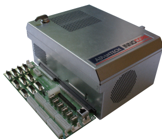
DPX-S1000 (shown with optional connector board)